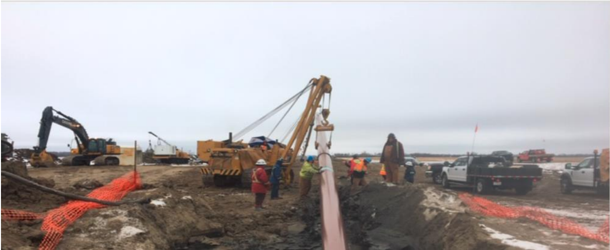
Line Pull: Exit Side