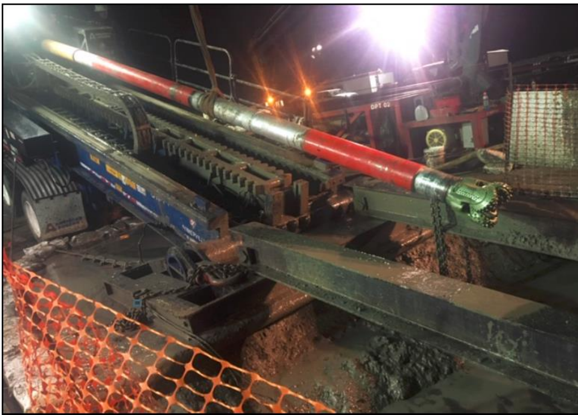
Drilling Pilot Hole