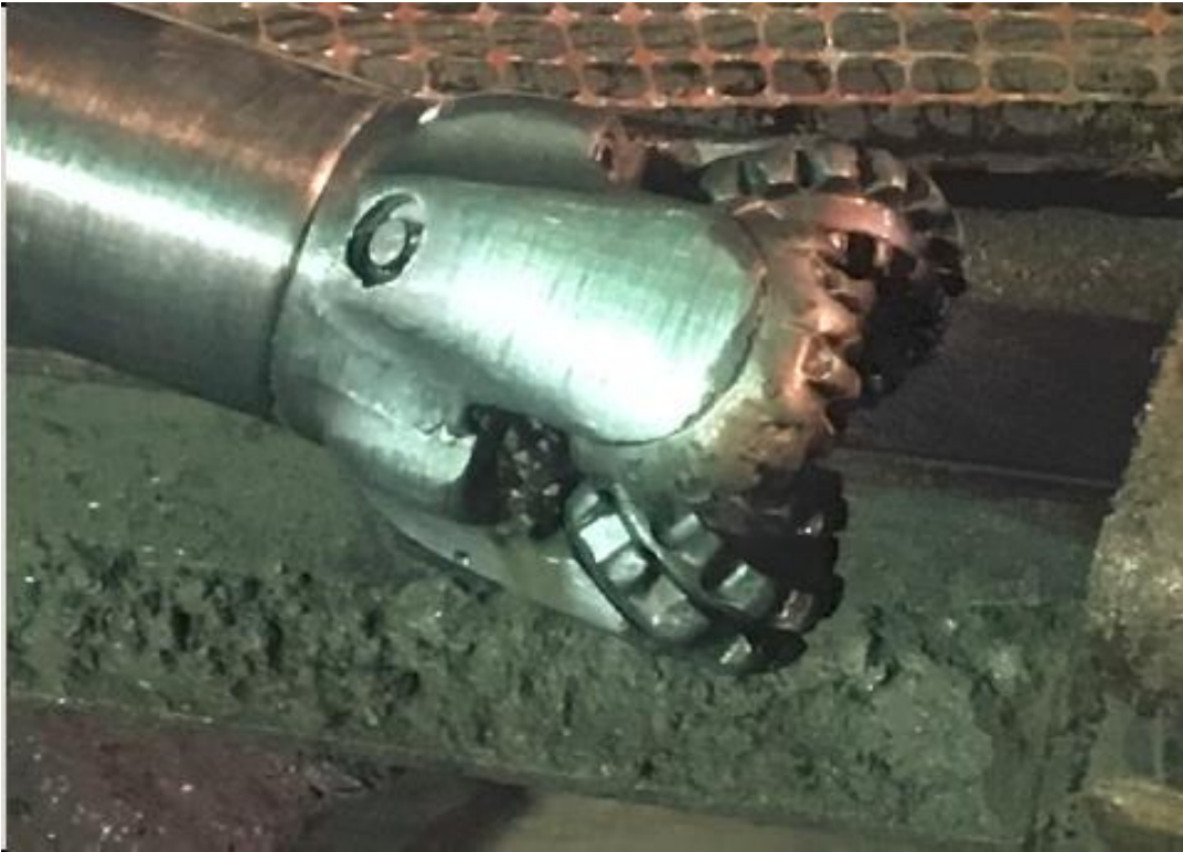
Pilot Hole Drill Bit (12")