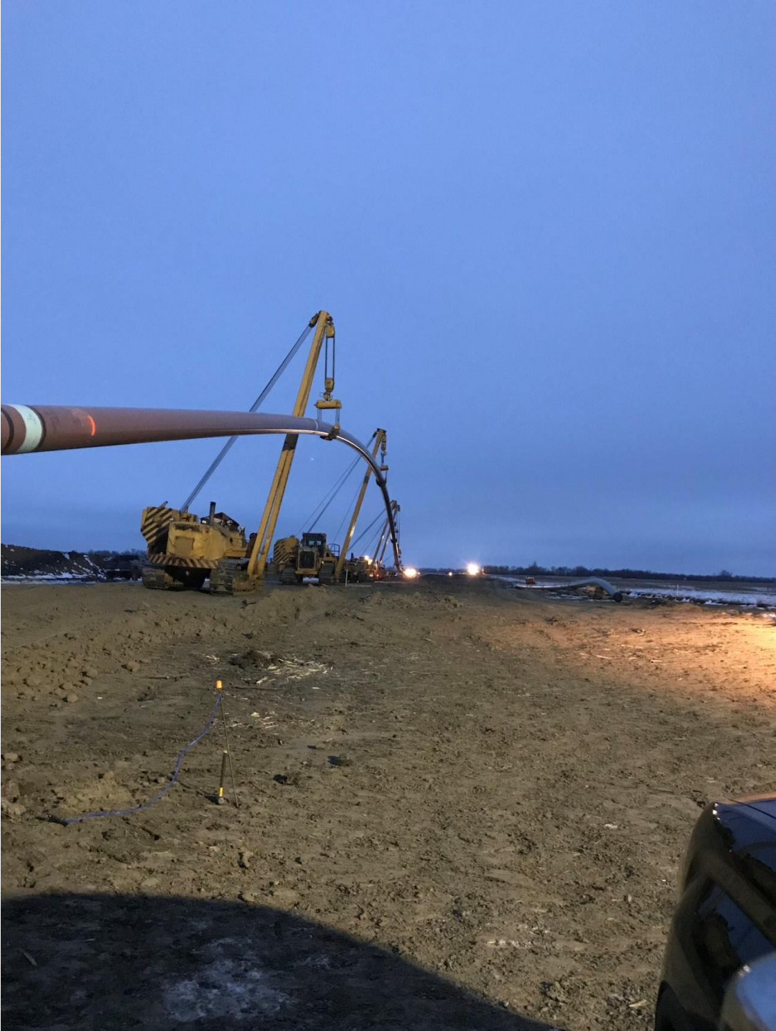
Side Booms During Line Pull