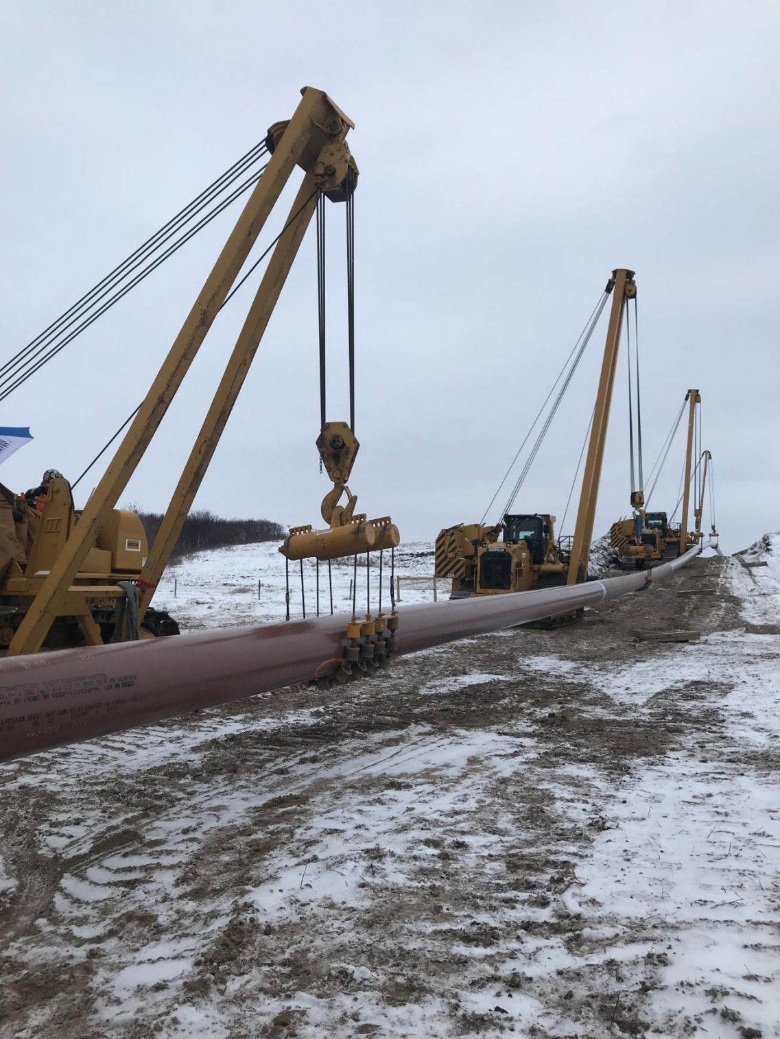
Side Booms During Line Pull